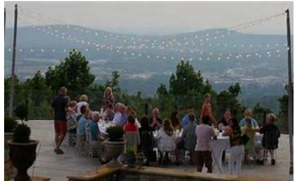
The View at Burritt on the Mountain

September 18, 5 pm Burritt on the Mountain Cocktails at the View