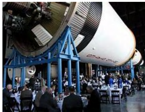
Biergarten at USSRC

November 7, 5 pm US Space and Rocket Center Biergarten