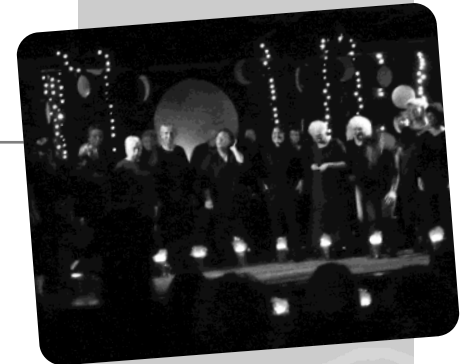
The Huntsville Feminist Chorus at their 2011 Winter Solstice Concert.

UAHuntsville concert in March, 1996. The concert is free and open to the public. Women's Studies will host a reception following. For more information call the Women's Studies Program Office at (256) 824-6190.