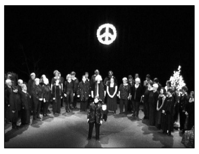
The Huntsville Feminist Chorus performed its annual Solstice Concert at the Von Braun Center Playhouse in December 2005.

The concert is sponsored by the UAH Women's Studies Program. For more information, call (256) 824-6210.