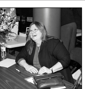
Allison gave a lecture (top) and signed books following (bottom).

The Women's Studies Program would like to thank all who supported the visit of novelist Dorothy Allison. It was a treat for all involved. Allison delivered a lecture and stayed over an extra day to attend a local performance based on