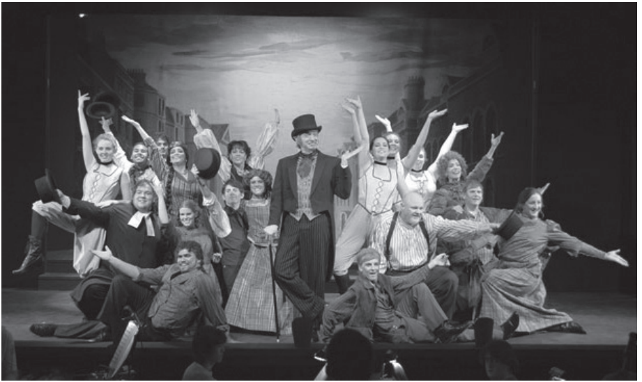
“The Mystery of Edwin Drood” April 2010 - UAH Theatre and Music

Talk to your advisor or call 256-824-6909 and enroll now!