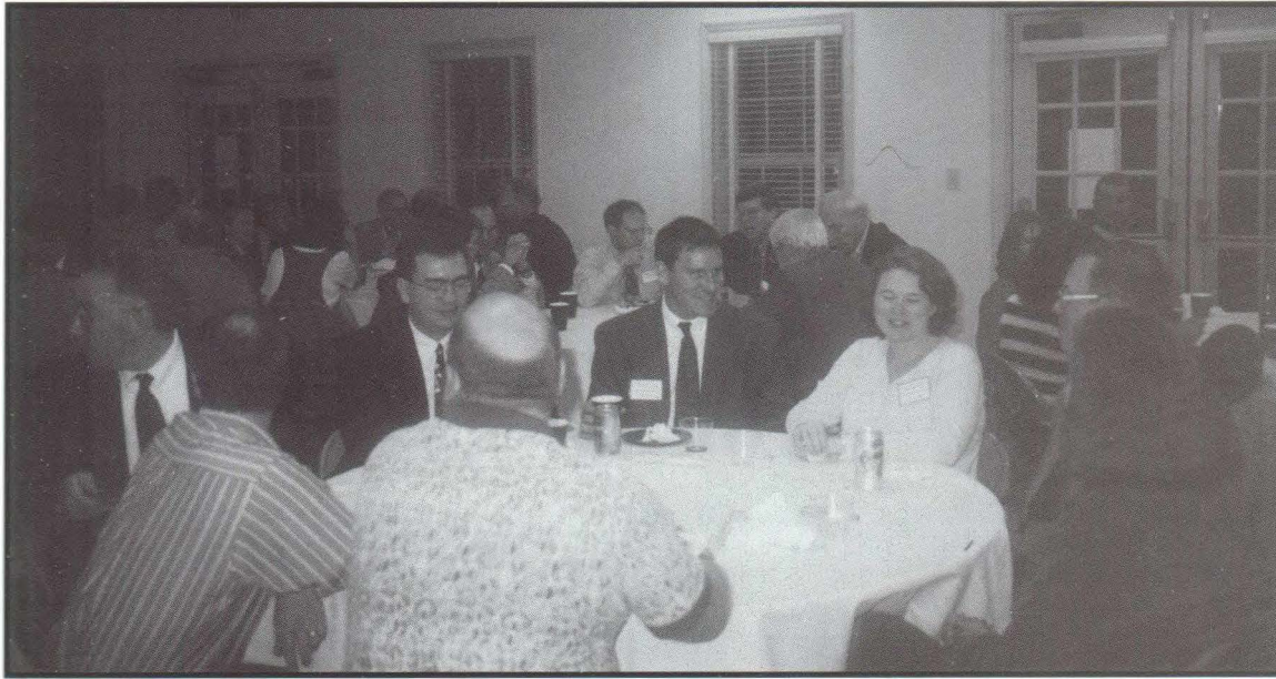
Nationalism around the world, topic of discussion during one of The Historical Society sessions held at Burritt on the Mountain.