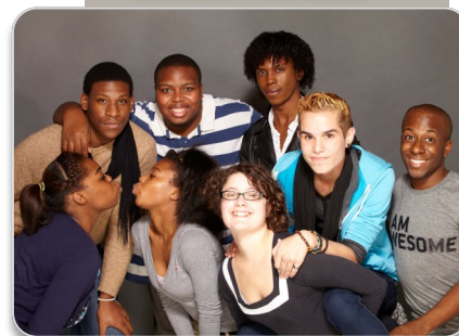
Above: Film poster and members of the cast from "The Year We Thought About Love."