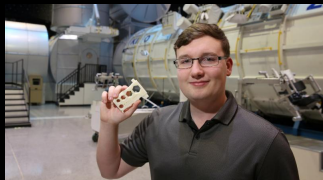
UAH student's multipurpose tool 3-D printed on International Space Station