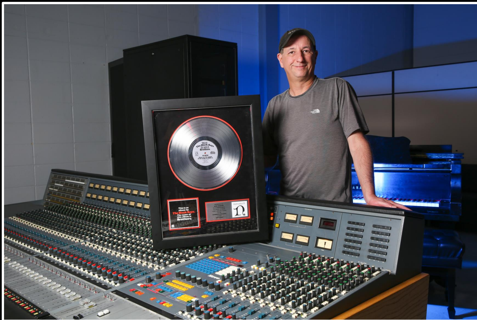
Roberts Hall Recording Studio