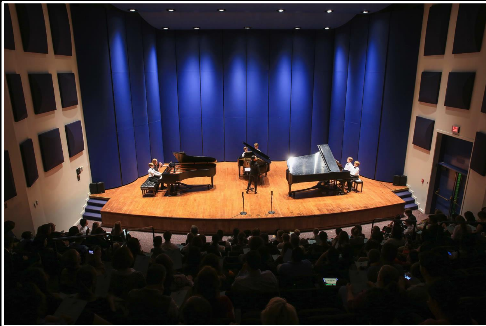
Roberts Recital Hall