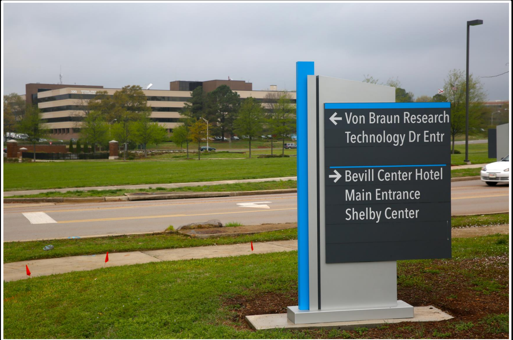
New Campus Signage