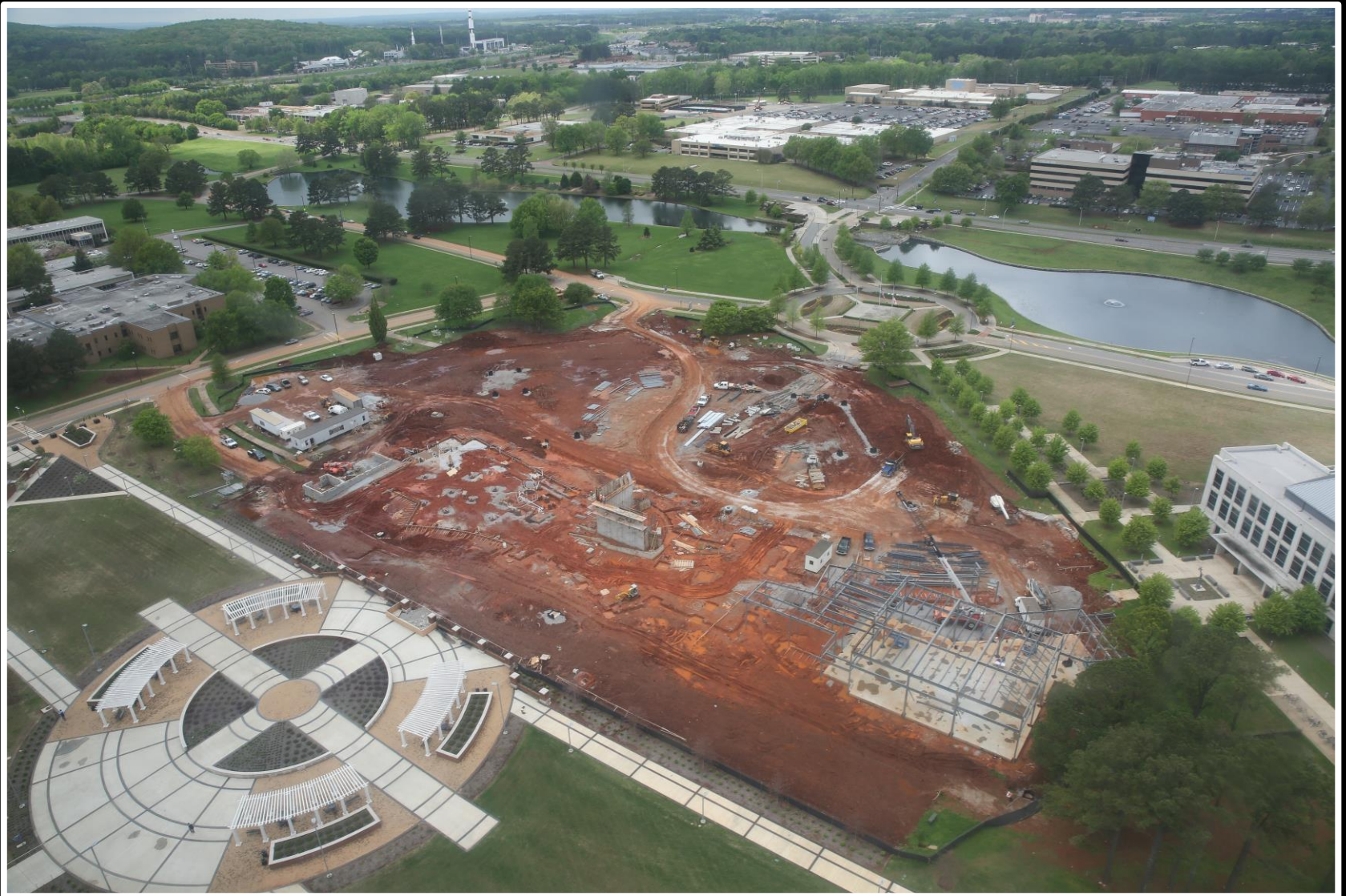
Student Services Building Construction