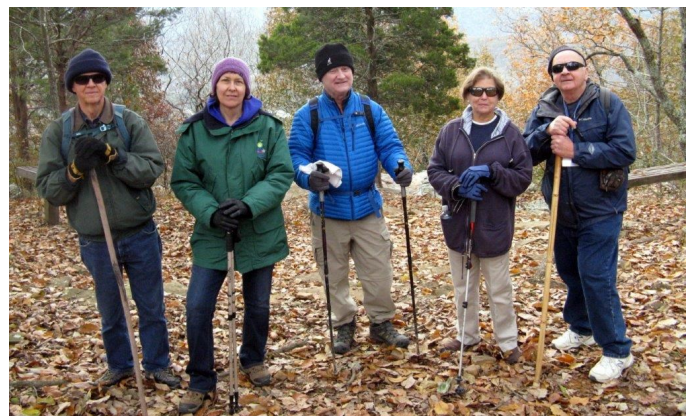
Hiking MIG at Bucca and Fire Tower trails