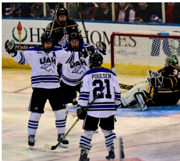
UAH Hockey Team