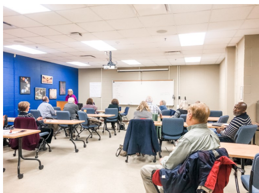
Beginning French Course