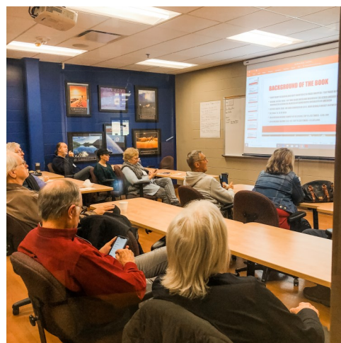
TED Talks Course