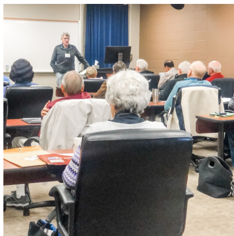
Topics in Law Course