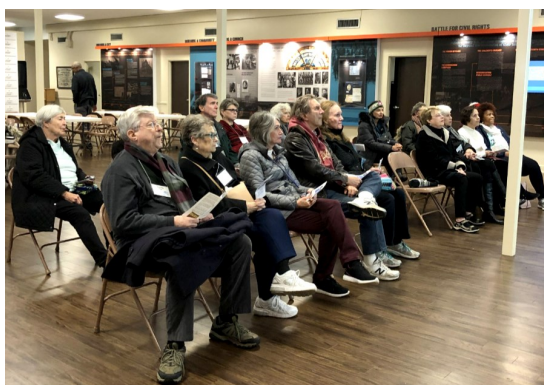
Members at 16th Street Baptist Church during Birmingham Day Trip

The OLLI Insider article submission deadline is the 17th of each month for the following month.