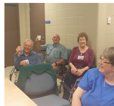
At Popcorn and a Movie Event