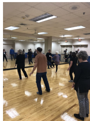
Intro To Tai Chi Course