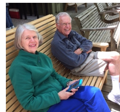
At OLLI Day Trip