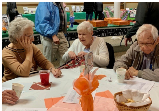
Members at the Teacher Appreciation Luncheon

Content for the January Insider is due on December 17, 2019 to OLLINewsletter@uah.edu .