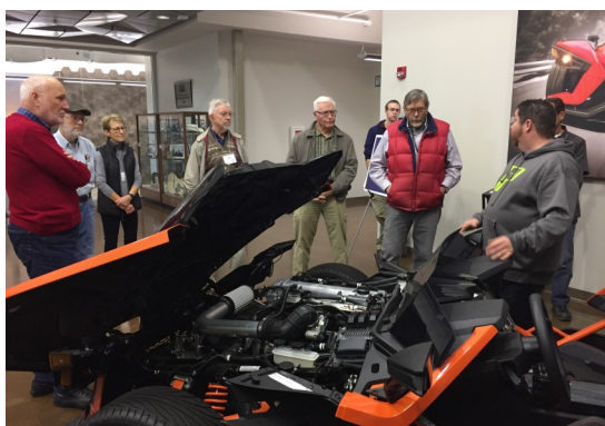
Members at the Polaris Industries Tour