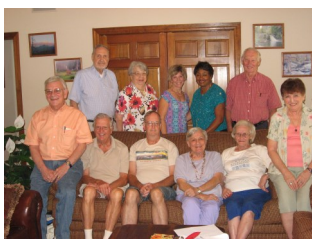
Serving on the Member Services Committee in 2013