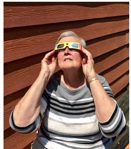
OLLI members view the Solar Eclipse over Huntsville on August 21st.