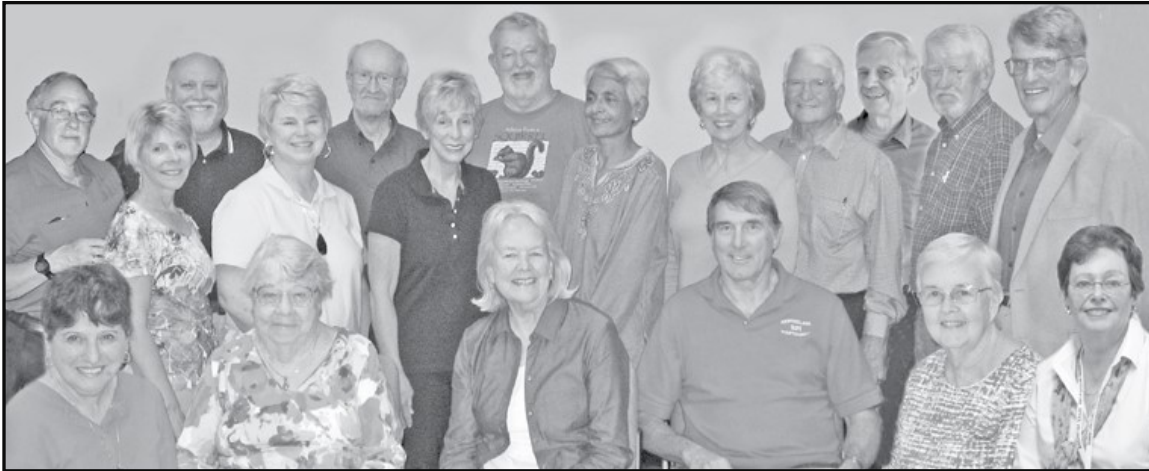
The OLLI Board of Directors 2014—2015