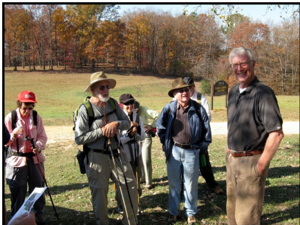
Article and Photographs courtesy of Bob Goodwin.