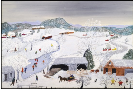
Logging

A festive treat in keeping with the season is in store for OLLI members on Tuesday, December 9, 2014, at 1:00 p.m. We have arranged a special docent tour of the "Grandma" Moses exhibit at the Huntsville Museum of Art (HMA). Anna Mary Robertson Moses is one of the most popular of American folk artists, and this collection of 30 of her original paintings from various sources is a fitting tribute by the museum to compliment the holidays. This untrained artist, whose career began late in her life, used her memories from childhood to imbue nostalgic landscapes and scenes of her native New England. Her works have become treasured keepsakes for our memory of by-gone days and holiday traditions.