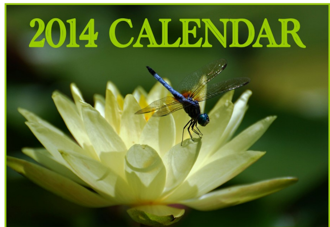
Featuring Winning Photos of OLLI's Annual Photo Contests

See p. 9 for instructions on how to purchase the OLLI calendar as a gift or for your personal use.