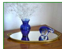
Examples of Reflections