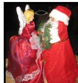
Cheerful table decorations: The angel & St. Nick!