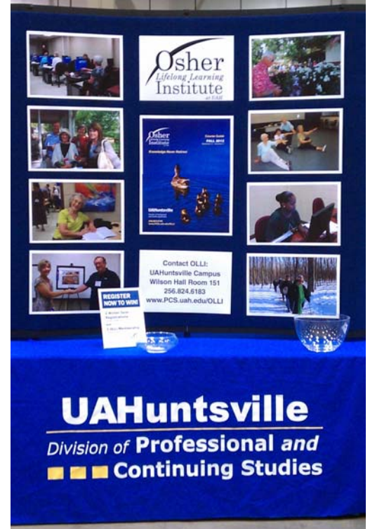
Poster that can be seen in libraries and other venues to illustrate the breath of OLLI classes and activities.