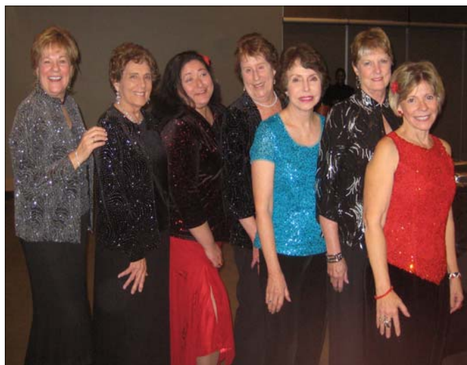
All the glittering ensembles gave a sparkling touch to the festive colors dotted throughout the hall.