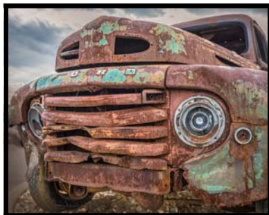
Needs Some Work

José Betancourt, one of the judges, offered this opinion: ". . . High dynamic range really helps the camera see what the eye sees in tonal range. This image comes close to this range without going too far into a "painterly effect." I also like that cars and trucks sometimes have a way with personification of the subject—the headlights as eyes, the grill or bumper as mouth and nose. I also think the rust color and textures are very strong in contrast with the smooth background. The composition has a good balance between headlights with a slight line taking you back into the background."