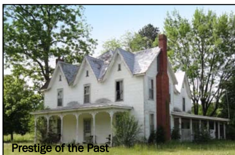
Prestige of the Past