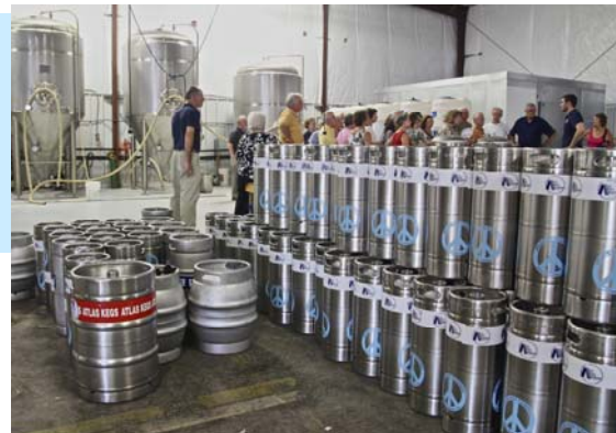
OLLI members at the brewery, the last of the SES tours.