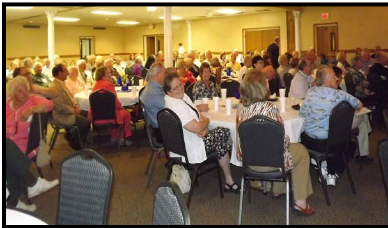
Around 200 smiling faces fill Wesley Hall for the Annual Meeting on May 11