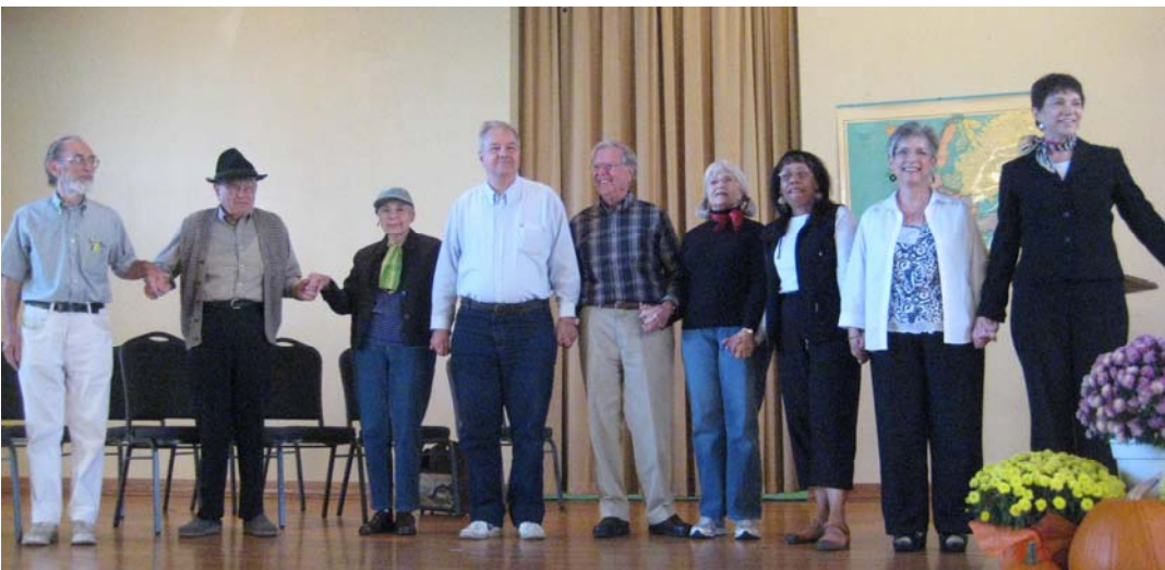
In the photos (top), the ‘actors’ take their bow; (bottom left) the audience is attentive; (right) the food line is progressing.