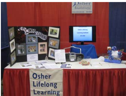
No stones are left unturned; photos, colorful brochures, handouts, a box for prize drawings, and a slideshow fill the booth to attract potential members.