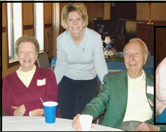
A pleasant time was had by all at the Potluck Luncheon which took place on January 21, at Trinity United Methodist Church.