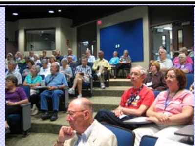
Are you in this photo? See photos from the OLLI picnic and STEM on http://picasaweb.google.com/Olliphotos