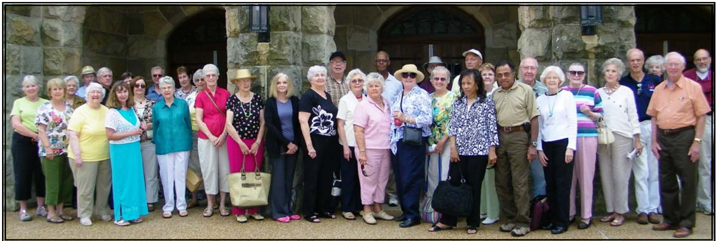
This large group of OLLI travelers enjoyed the sights and sounds on their excursion to the University of the South Sewanee campus on July 10.