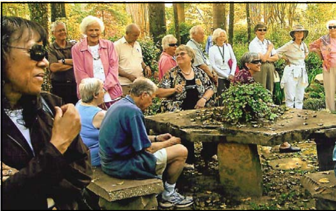
OLLI Members stroll the lovely gardens at the Westervelt Warner Museum