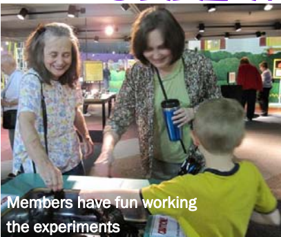
Members have fun working the experiments

About 35 OLLI members visited Sci-Quest on April 23. We were given a brief introduction to Sci-Quest in the auditorium and then watched a 3-D film on tornadoes. It described the air currents that cause tornadoes and visually showed the damage that different levels of tornadoes can cause. A live experiment with fire demonstrated the upward air currents that occur during a tornado.