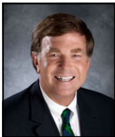
Mayor Tommy Battle