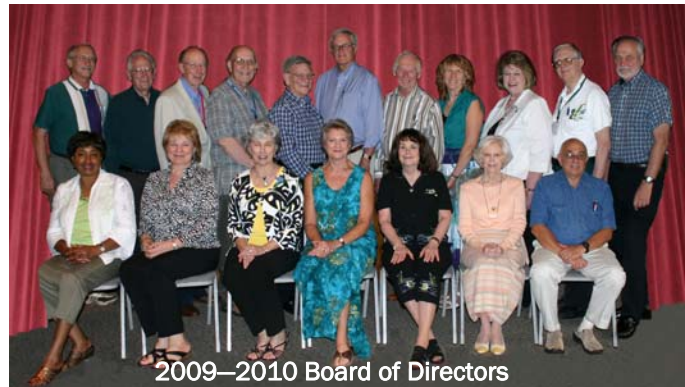
2009–2010 Board of Directors