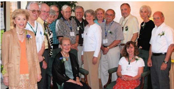
Much gratitude goes to all the instructors who give so much time, sharing their knowledge and themselves for the benefit of OLLI members. We appreciate all of you.