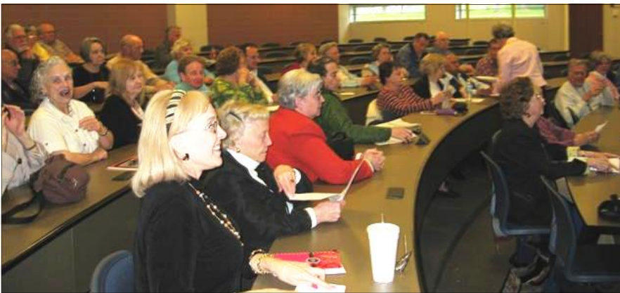
A captivated audience

The Writing Your Life Story readers presented an opportunity to OLLI Members on Bonus Day April 15, to hear excerpts from their life stories. The essays brought entertainment, laughter, sadness, and fun to those in attendance. The purpose – to inspire members of the audience to join the writing course – was also served.