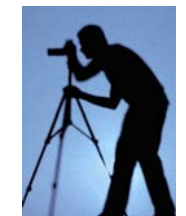
Advanced Photo Manipulation Class