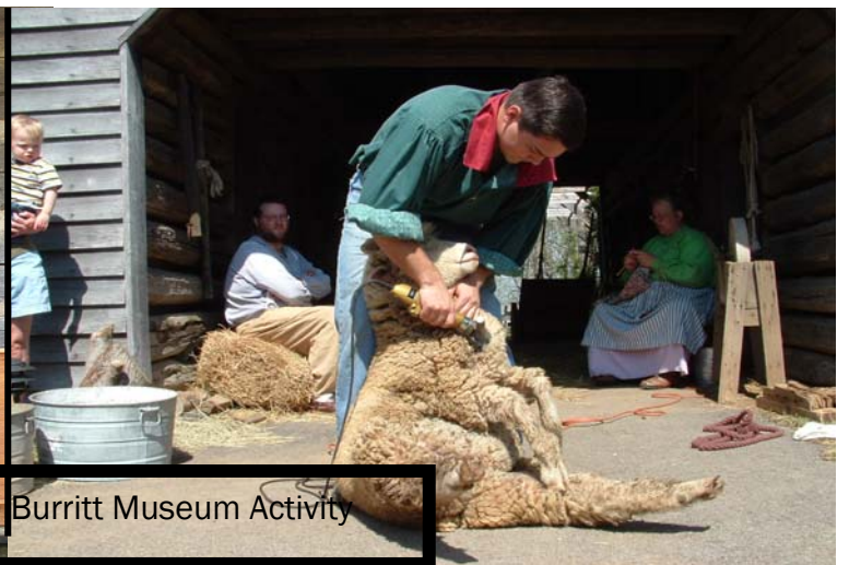
Burritt Museum Activity