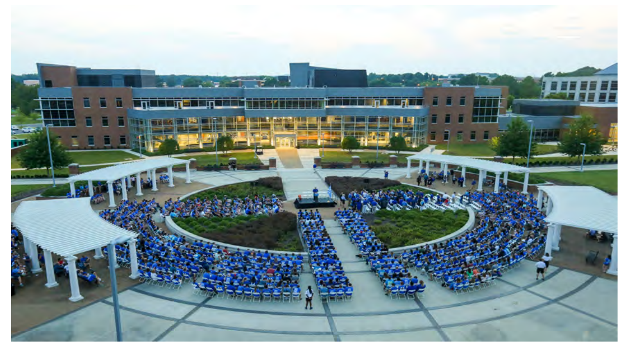
Fall Convocation to welcome new students as they begin their academic journey at UAH