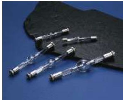
Mercury Xenon Short-Arc Lamps

Mercury xenon short-arc lamps operate similarly to mercury short-arc lamps, except that they contain a mixture of xenon and mercury vapor. However, they do not require as long a warm up period as regular mercury short-arc lamps, and they have better color rendering. They are used mainly in industrial applications.