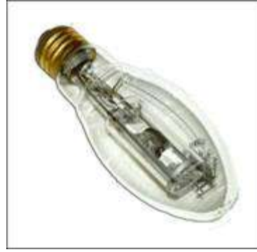
Metal Halide Lamp

Metal halide lamps (MH) use metal halides such as sodium iodide in the arc tubes, which produce light in most regions of the spectrum. They provide high efficacy, excellent color rendition, long service life, and good lumen maintenance, and are commonly used in stadiums, warehouses, and any industrial setting where distinguishing colors is important. They are also used for the bright blue-tinted car headlights and for aquarium lighting. Low-wattage MH lamps are available and have become popular in department stores, grocery stores, and many other applications where light quality is important. Of all the mercury lamps, MH lamps should be considered a complete system of lamp, ballast, igniter, fixture, and controls.