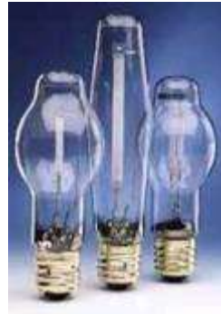
High pressure sodium lamps

High pressure sodium lamps (HPS) are a highly efficient light source, but tend to look yellow and provide poor color rendition. HPS lamps were developed in 1968 as energy-efficient sources for exterior, security, and industrial lighting applications and are particularly prevalent in street lighting. Standard HPS lamps produce a golden (yellow/orange) white light when they reach full brightness. Because of their poor color-rendering their use is limited to outdoor and industrial applications where high efficacy and long life are priorities.