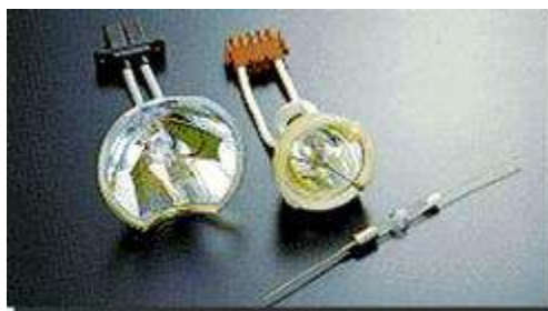
Mercury Short-Arc Metal Halide Lamp

The mercury short-arc lamps contain relatively larger amounts of mercury, typically between 100 mg and 1,000 mg. Nearly a quarter of these lamps contain more than 1,000 mg of mercury.