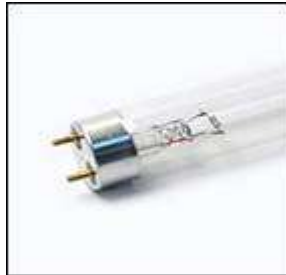
Germicidal Lamp

Germicidal lamps do not use phosphor powder and their tubes are made of fused quartz that is transparent to short-wave UV light. The ultraviolet light emitted kills germs and ionizes oxygen to ozone. These lamps are often used for sterilization of air or water.