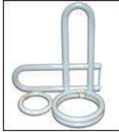
U-tube and Circline Lamps

Linear fluorescent, U-tube, and Circline lamps are used for general illumination purposes. They are widely used in commercial buildings, schools, industrial facilities, and hospitals.