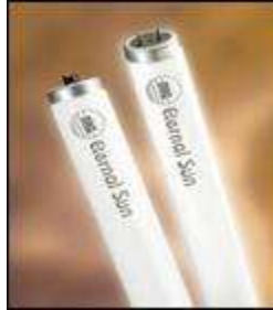
Tanning Lamps

Tanning lamps use a phosphor composition that emits primarily UV-light, type A (non-visible light that can cause damage to the skin), with a small amount of UV-light, type B.