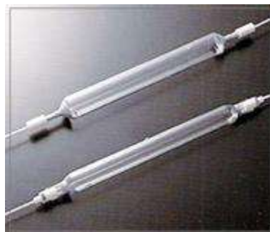
Mercury Capillary Lamps

Mercury capillary lamps provide an intense source of radiant energy from the ultraviolet through the near infrared range. These lamps require no warming-up period for starting or restarting and reach near full brightness within seconds. They come in a variety of arc length, radiant power, and mounting methods, and are used in industrial settings (i.e., for printed circuit boards), for UV curing, and for graphic arts. UV curing is widely used in silkscreening, CD/DVD printing and replication, medical manufacturing, bottle/cup decorating, and converting/coating applications.