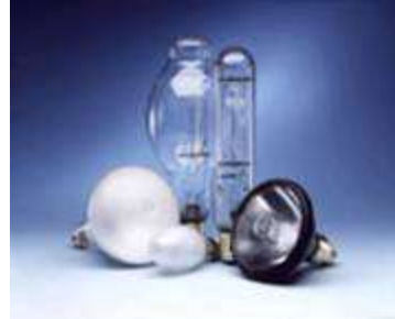
Mercury Vapor Lamps

Mercury vapor lighting is the oldest HID technology. The mercury arc produces a bluish light that renders colors poorly. Therefore, most mercury vapor lamps have a phosphor coating that alters the color and improves color rendering to some extent. Mercury vapor lamps have a lower light output and are the least efficient members of the HID family. They were developed to overcome problems with fluorescent lamps for outdoor use but are less energy efficient than fluorescents. Mercury vapor lamps are primarily used in industrial applications and outdoor lighting (e.g., security equipment, roadways, and sports arenas) because of their low cost and long life (16,000 to 24,000 hours).