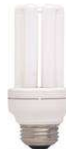
Examples of compact fluorescent lamps bulbs

High intensity discharge (HID) 4 is the term commonly used for several types of lamps, including metal halide, high pressure sodium, and mercury vapor lamps. HID lamps operate similarly to fluorescent lamps. An arc is established between two electrodes in a gas-filled tube, causing a metallic vapor to produce radiant energy. HID lamps do not require phosphor powder, however, because a combination of factors shifts most of the energy produced to the visible range. In addition, the electrodes are much closer together than in most fluorescent lamps; and under operating conditions the total gas pressure in the lamp is relatively high. This generates extremely high temperatures in the tube, causing the metallic elements and other chemicals in the lamp to vaporize and generate visible radiant energy.