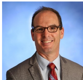
Dr. William Wilkerson Honors College