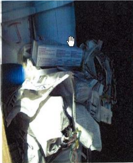
Picture 24 - Storage Shed#4 - Three spent mercury bulbs on top of Non PCBs ballasts.