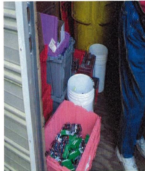
Picture 10 - Universal Waste Storage Shed#1 - Storage of open, unlabeled and not dated containers of spent alkaline, lithium and lead acid batteries