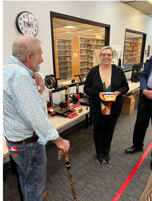
Retirees in Makerspace

use 3D printers, make posters, and engrave a variety of materials, the Special Collection of science fiction literature, and the archives space where UAHRA members have been working on the photo identification project described in the Winter 2023 newsletter. There is a lot more photo identification to be done, so UAHRA members are encouraged to participate.