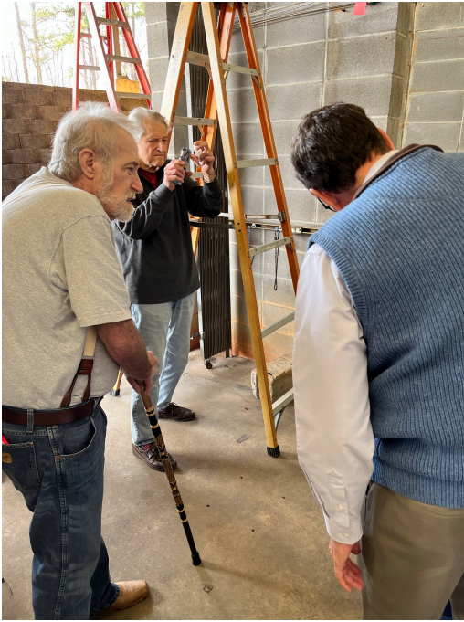
Retirees in the Propulsion Research Center