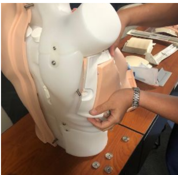
Repairing a chest tube and needle decompression trainer. The chest drain pad with four ribs was made at a cost savings of $200.

The group has developed a variety of silicone rubber patches to extend the life of trainers that have needle holes after many hours of student use. Many of the trainers can cost thousands of dollars.