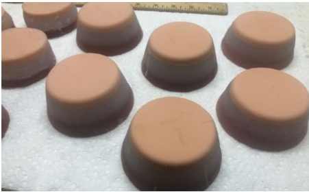
Needle injection pads made at a cost of $3 as compared to purchased pads of $25+.

The group has developed a variety of silicone rubber patches to extend the life of trainers that have needle holes after many hours of student use. Many of the trainers can cost thousands of dollars.