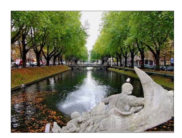
Königsallee in downtown Düsseldorf

Access to university Mensa (cafeteria) for lunch.