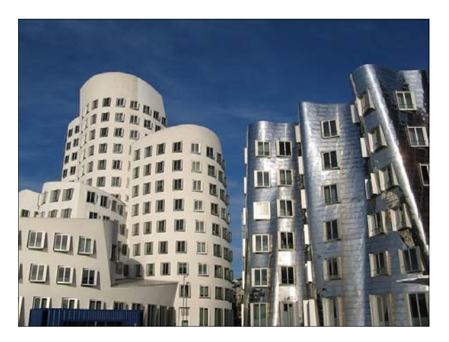
Frank Gehry buildings in Düsseldorf