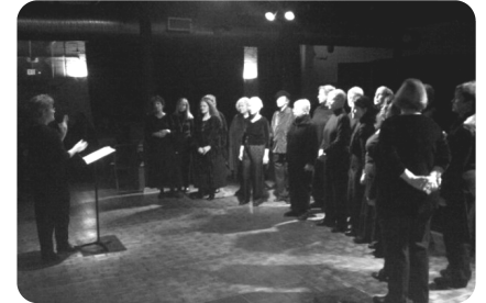
The Huntsville Feminist Chorus at their 2010 Winter Solstice Concert.

The UAHuntsville Women's Studies Program will publicize details in the online newsletter and through e-mail. The concert will be free and open to the public. More information at (256) 824-6190.