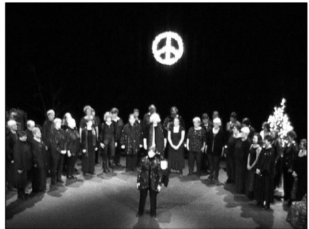
The Huntsville Feminist Chorus performed its annual Solstice Concert at the Von Braun Center Playhouse in December 2005.

The concert is sponsored by the UAH Women's Studies Program. For more information, call (256) 824-6210.