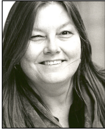
Dorothy Allison will speak at UAH on Friday, April 21, at 7:30 p.m. in Chan Auditorium.