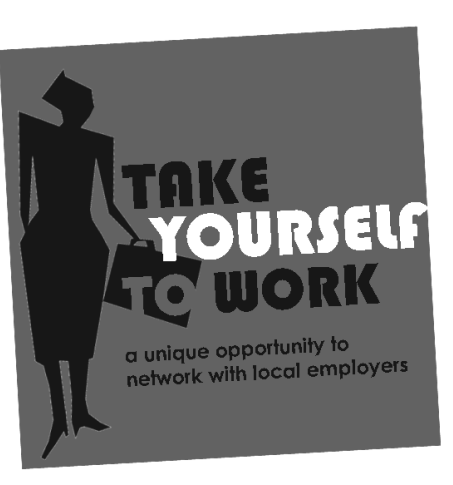
Women's Studies, AAUW, WEDC, POWER, and WAFF Job-Link offer career networking for students on November 5 in the Shelby Center.

The luncheon will be held in the Shelby Center third-floor faculty lounge from 12 to 1:30 pm. It will feature a panel of successful local