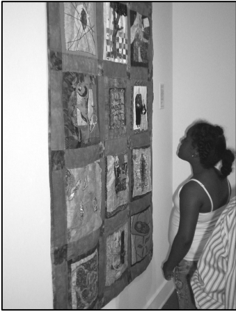
The community art quilt featured work by 18 women artists.