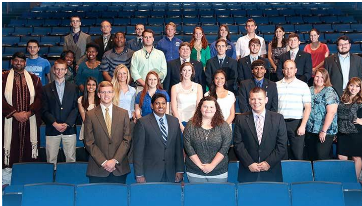
UAH Student Government Association, 2013-14

See accompanying notes to financial statements