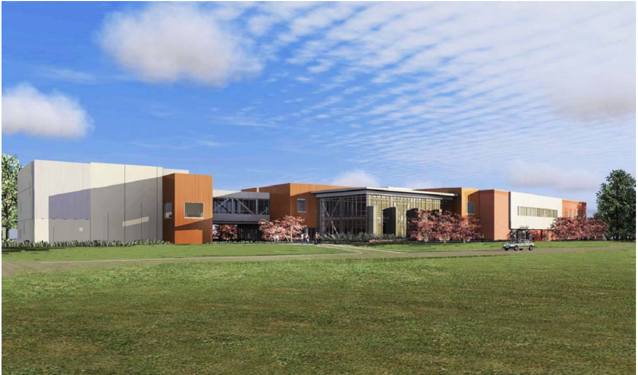
View from Holmes Avenue