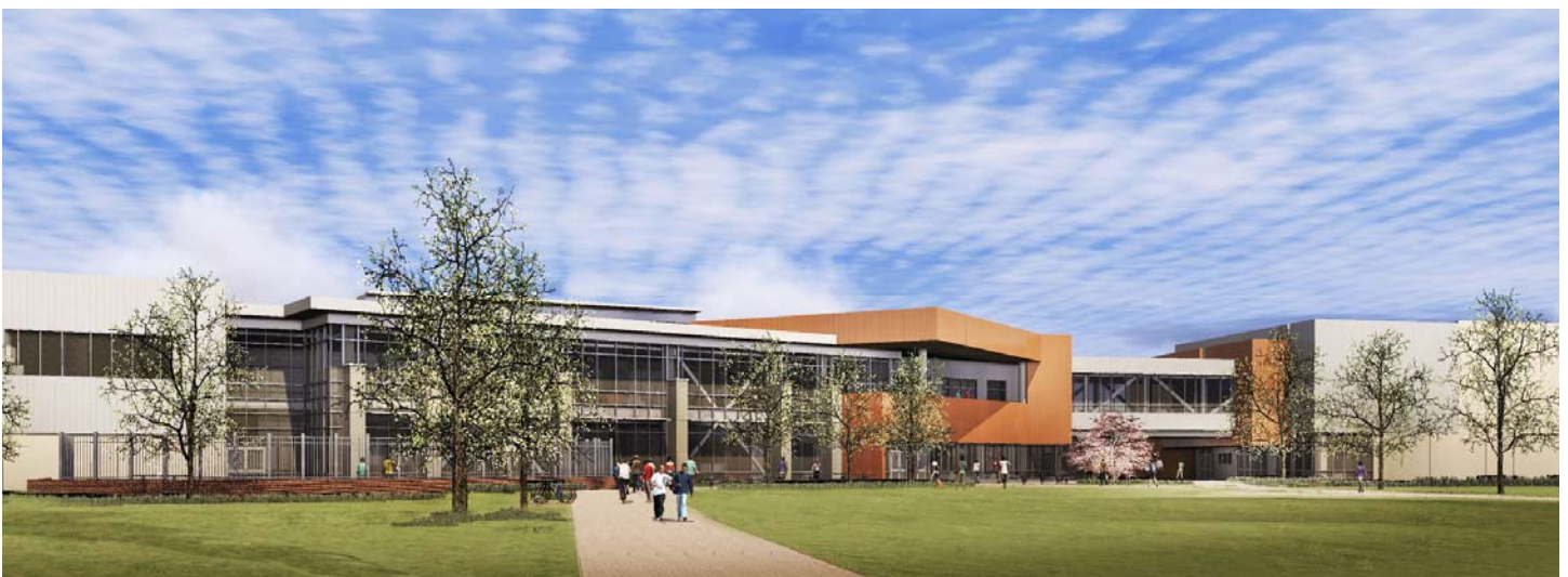
View from Greenway

To have items included in future editions, please email information to kimberly.fuller@uah.edu and put Structures in the subject line.