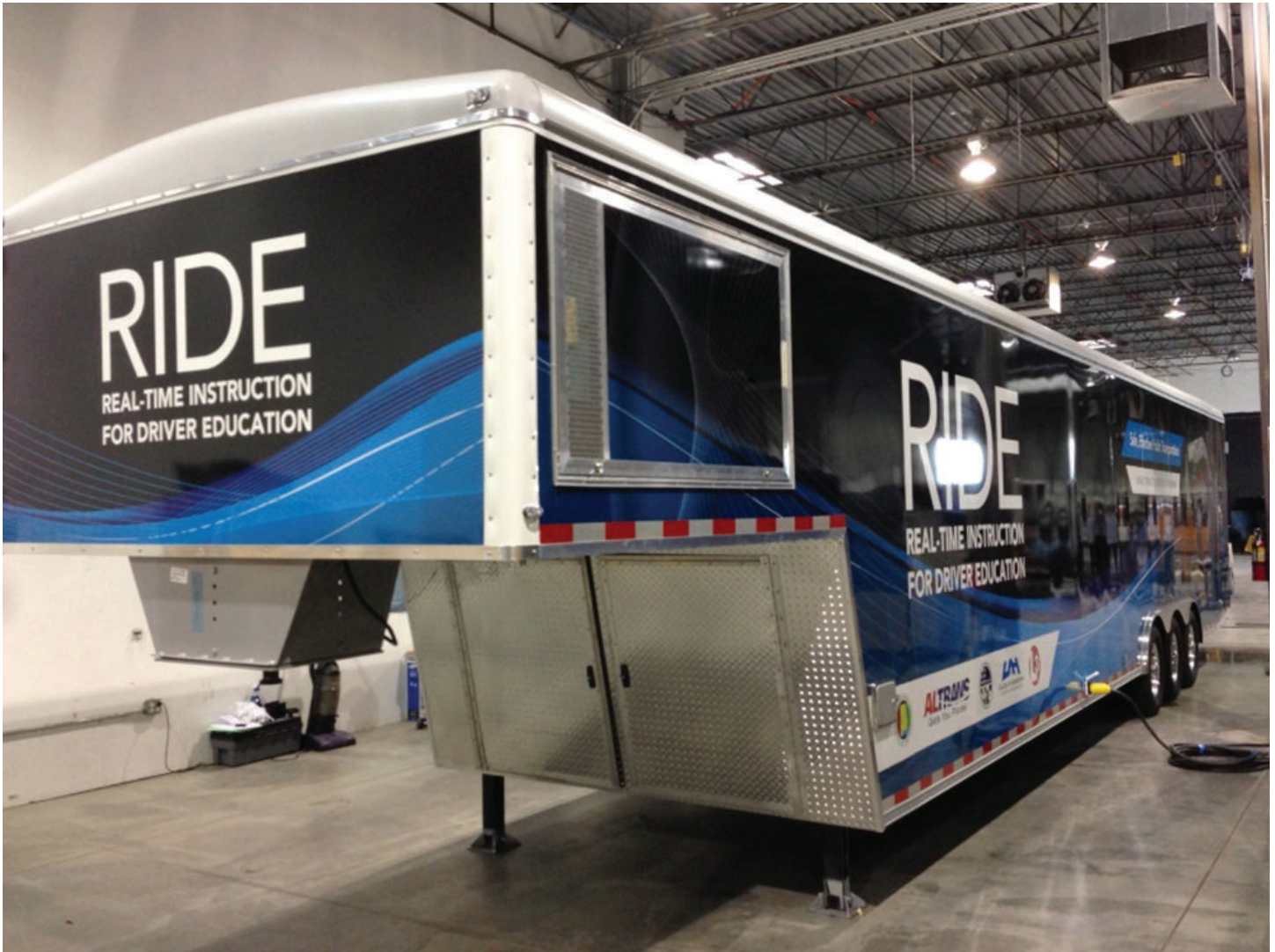
RIDE Driving Simulator - Outside View

The University of Alabama in Huntsville is pleased to announce the arrival of a brand-new high-tech driving simulator, which will be used to provide hands-on training to rural transit operators throughout the state.