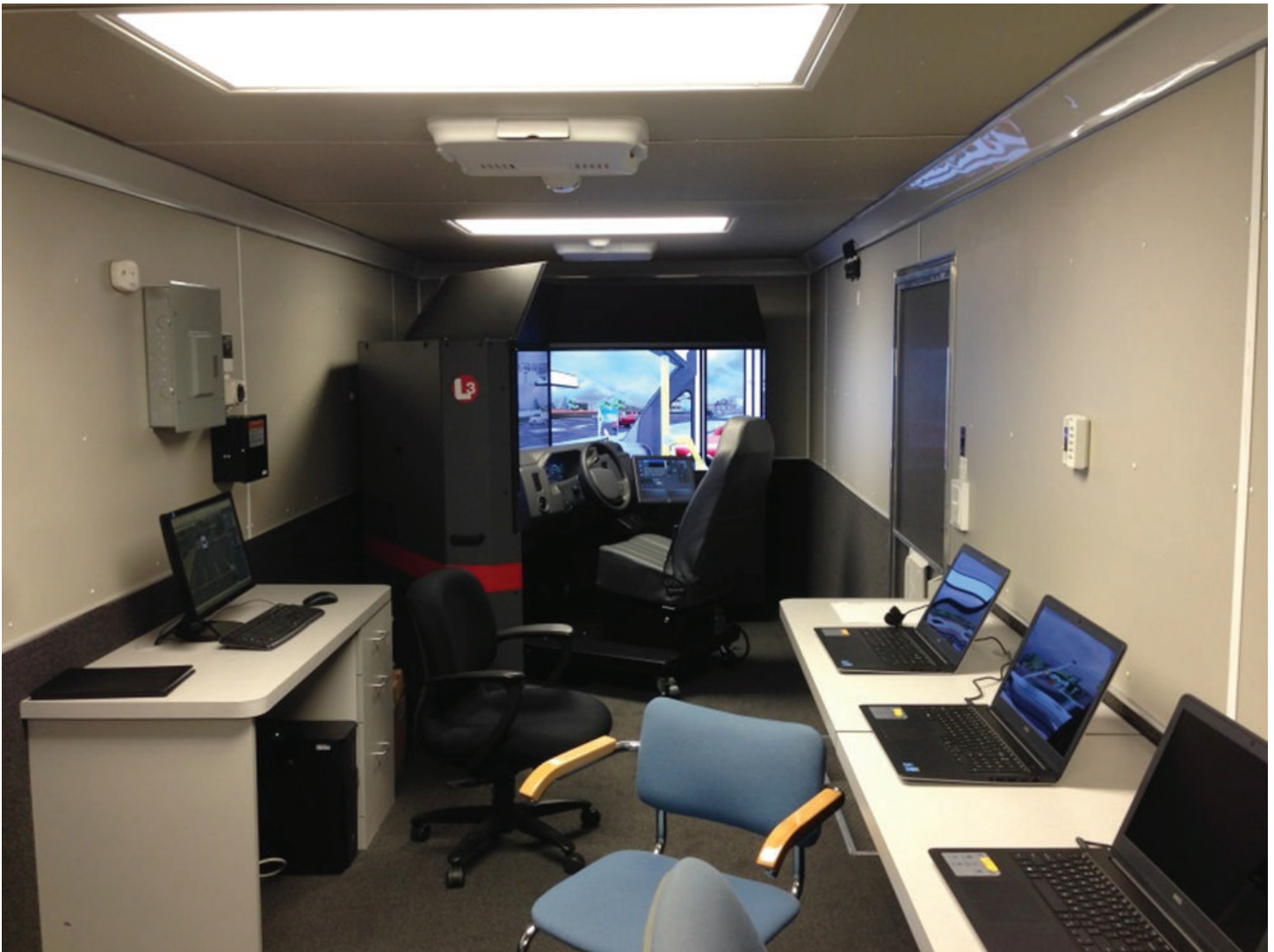
RIDE Driving Simulator - Inside View

ing passenger and driver safety. Additional scenarios can also be developed on an as-needed basis using RIDE's non-mobile companion simulator, which will be housed in the Department of Civil & Environmental Engineering.