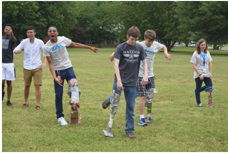
Ready to Change the World?

Changing the world is what engineers do—by solving problems with innovation, creativity, and by applying science and technology.