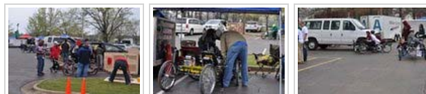
2011 NASA Great Moonbuggy Race

NASA / Alabama Space Grant Consortium added 75 new photos to the album 2011 NASA Great Moonbuggy Race .